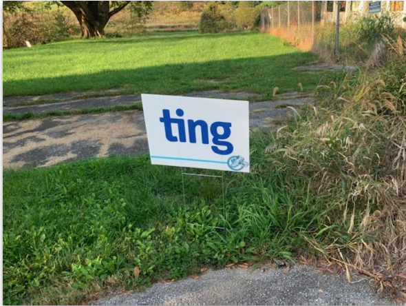
Run for Resilience: Survivors 5K/1 Mile Walk