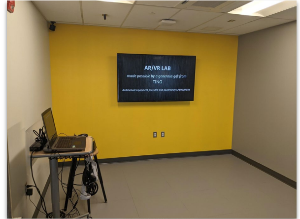
Ting Sponsored AR/VR Lab at Exploration Commons