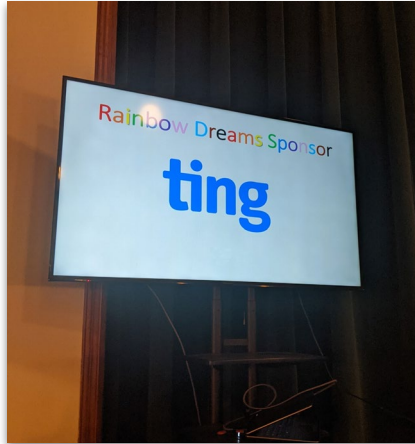
4th Annual Shantay You Stay Drag Show